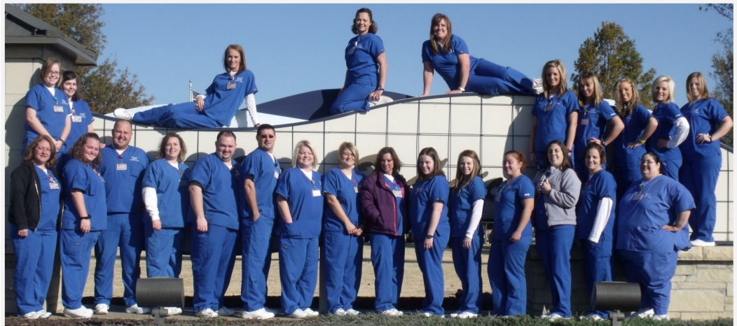
BRTC Nursing III students from the December 2011 graduating class have been working to begin a "Seats for Tots" car seat program in Lawrence and Randolph Counties, which began as a class project in the Fall.