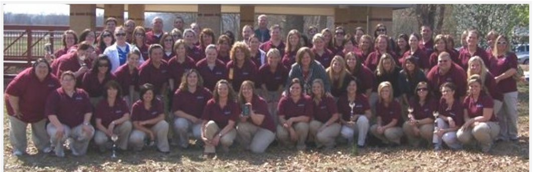
BRTC Practical Nursing Students at ALPNA Competition

BRTC students in Practical Nursing I, II, and III earned several trophies at the Spring Conference of ALPNA (Arkansas License Practical Nurses' Association) held March 17-18 at University of Arkansas Community College at Batesville. LPN schools from around the state attended the event.