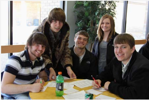
Students from Hoxie High School practice for an FBLA event while on the BRTC Campus attending the 2nd Annual Business Technology Day hosted by the Business Department.