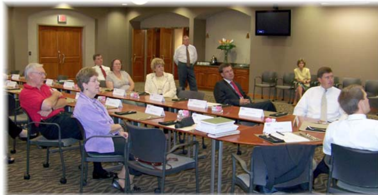
Major donors meet with college officials in an initial meeting in the Community Conference Center last week.