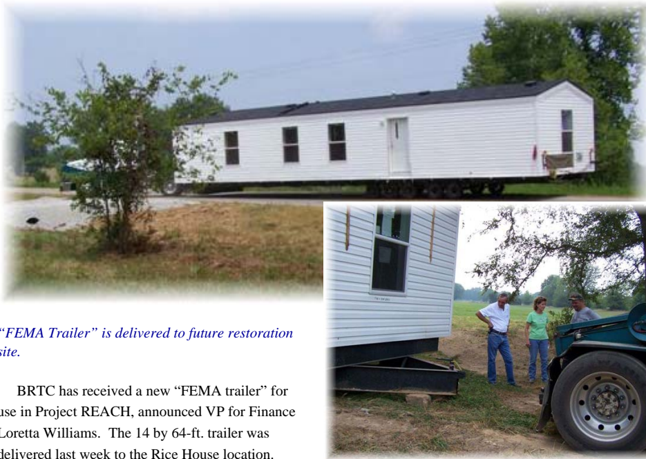
"FEMA Trailer" is delivered to future restoration site.