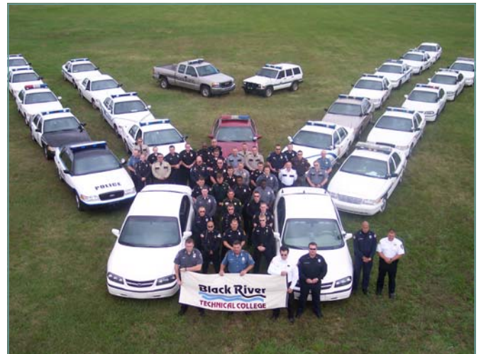
LETA CLASS 2004 - B